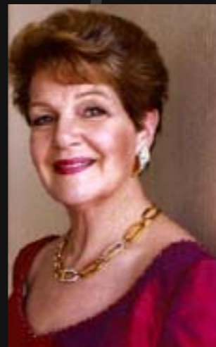
Dame Malvina Major

Dame Malvina Major , PCNZM. DBE. OBE. ATCL. LTCL. LRSM. Hon D Litt [Massey]. Hon D Humanities [Waikato], will tell the story of her life in song, featuring composers Schubert, Rossini, Puccini, Paganini and Verdi.